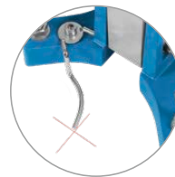
Integrated centre indicator